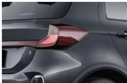
C-shape blacken-through-style taillight