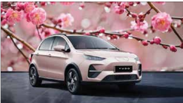
Plum blossom pink