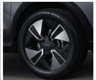
16-inch Aluminum alloy rim